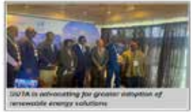
GUTA is advocating for greater adoption of renewable energy solutions.

Home Next > Comments (3) Listen to Article